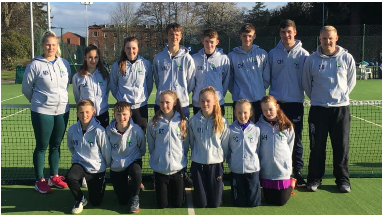
Tennis Tayside winners of Inter-District 2019