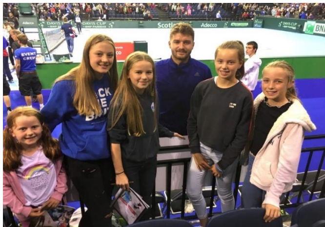
Pictured at the Davis Cup 2018 Glasgow

Wimbledon 2018 straight after, was as usual a wonderful experience even though again we had a tough draw, drawing last year's champions in the first round, a tough loss! We continued our good form through the season with plenty more challenger finals and titles, culminating in that second ATP250 win at The Stockholm Open at the end of the season. I also really enjoyed being up in Glasgow for The Davis Cup, what an atmosphere, being a small part of the team this time, has really given me a huge motivation to play in front of a Davis Cup crowd in the future. Now ranked at world number 63 in doubles I am really looking forward to 2019 and hope to have a real breakthrough year. Keep working hard on your tennis in the off season and all the best Tennis Tayside.